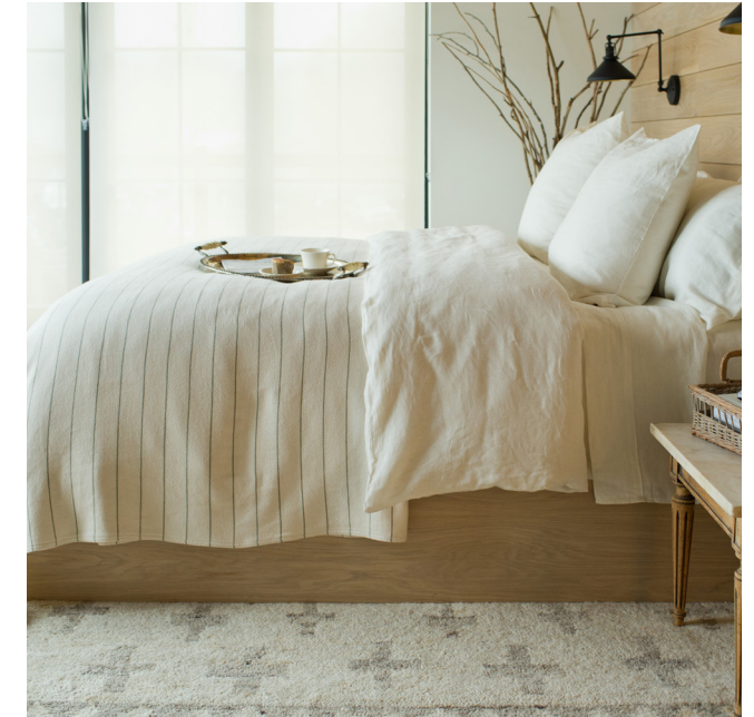
COTTON PINSTRIPE BLANKET $395 - $475 100% AMERICAN COTTON WOVEN + HAND-DYED IN MAINE LOW IMPACT DYES NATURAL + SLATE GREY