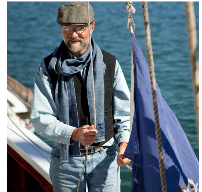
CAMDEN SCARF $225 100% ORGANIC MERINO WOOL HANDWOVEN + HAND-DYED IN MAINE ALL NATURAL DYES INDIGO