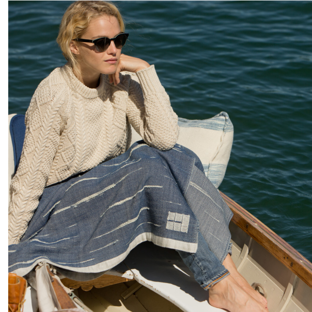
WHITECAPS THROW $625 100% MERINO WOOL HANDWOVEN + HAND-DYED IN MAINE ALL NATURAL DYES INDIGO / GREY WITH NATURAL