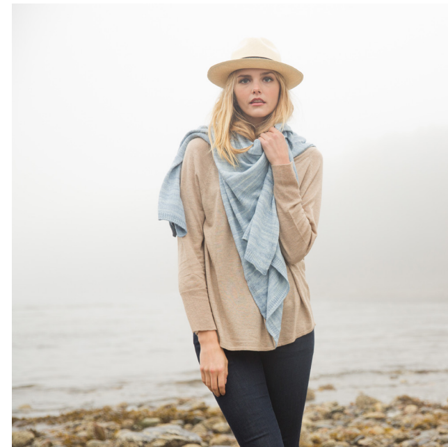
KENNEBUNK WRAP $295 50% MERINO WOOL, 50% TUSSAH SILK KNIT IN USA, HAND-DYED IN MAINE LOW IMPACT DYES WEDGWOOD