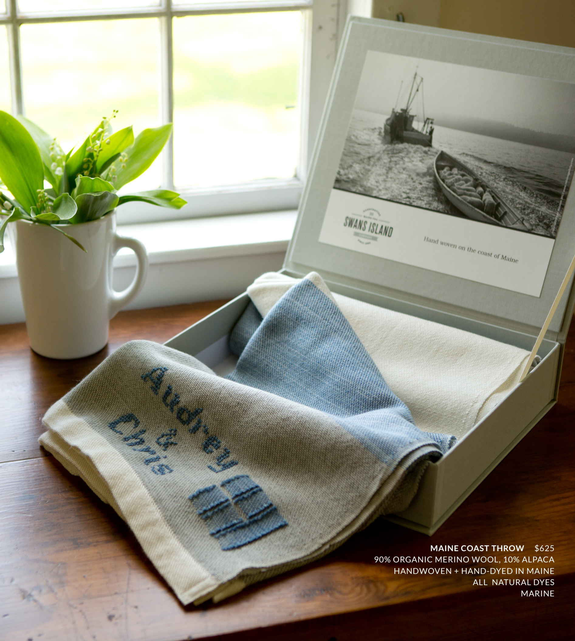
MAINE COAST THROW $625 90% ORGANIC MERINO WOOL, 10% ALPACA HANDWOVEN + HAND-DYED IN MAINE ALL NATURAL DYES MARINE