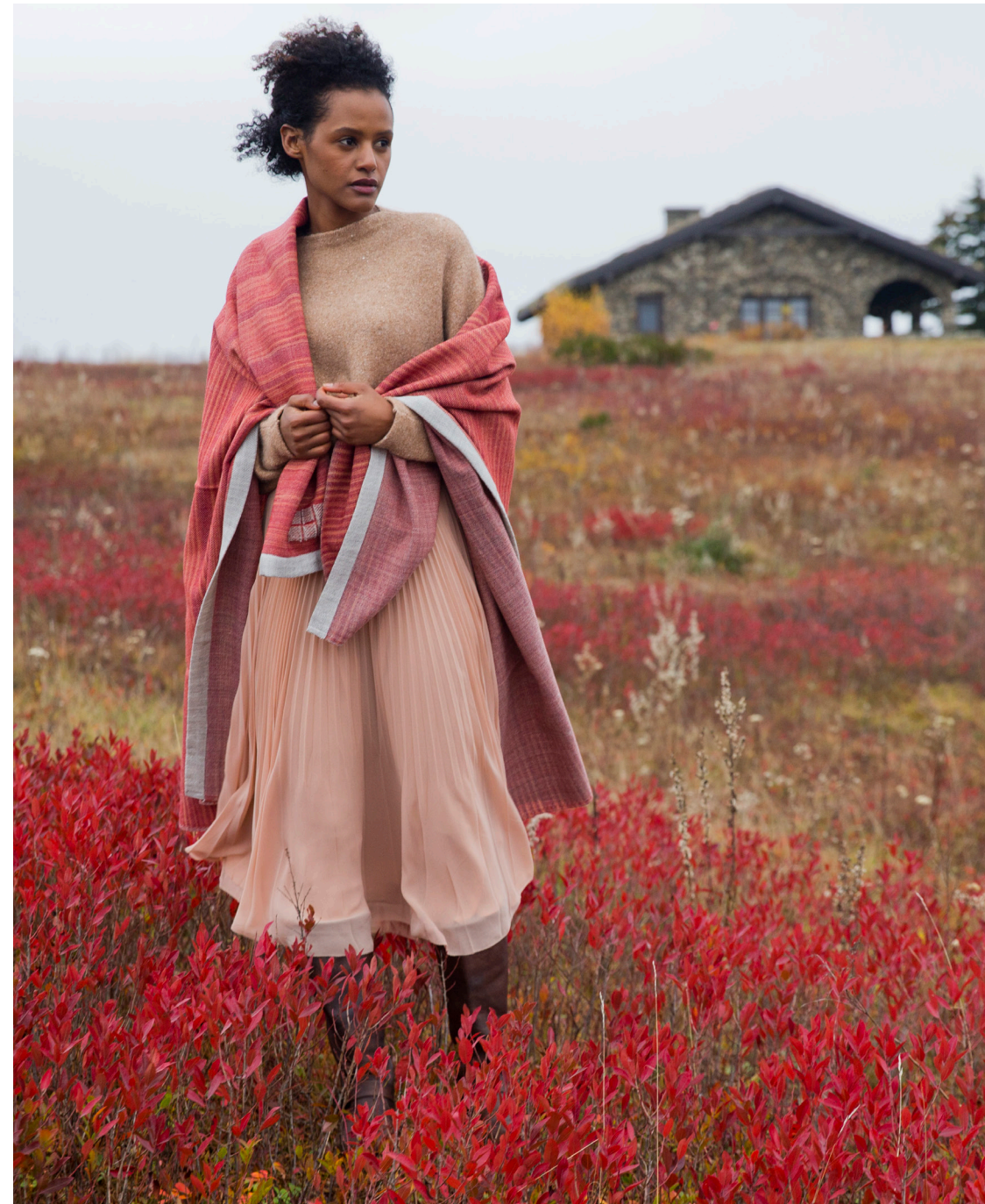
KATAHDIN THROW $625 100% ORGANIC MERINO WOOL HANDWOVEN + HAND-DYED IN MAINE ALL NATURAL DYES BITTERSWEET