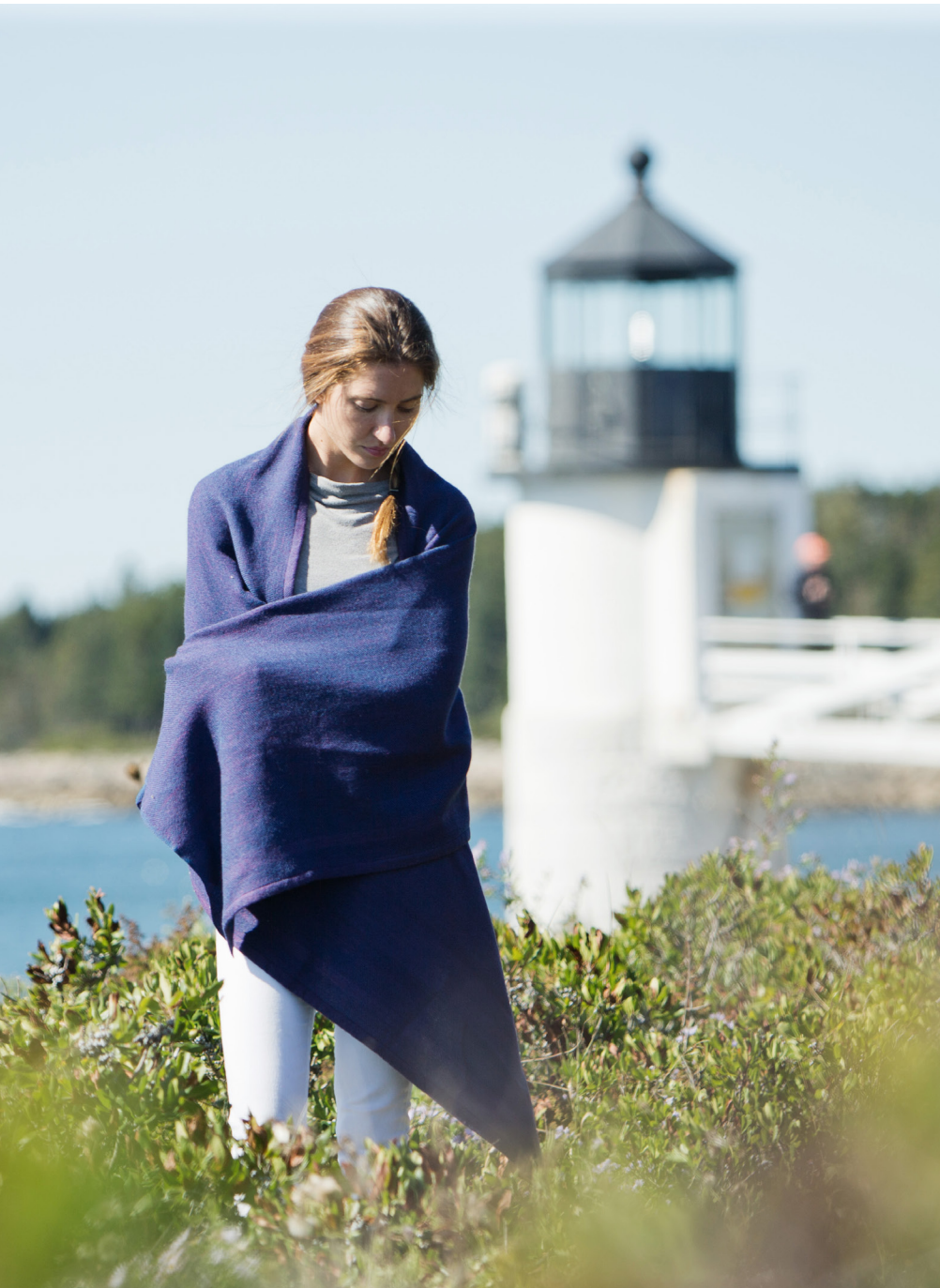
BOOTHBAY WRAP $475 66% MERINO WOOL 34% TUSSAH SILK HANDWOVEN + HAND-DYED IN MAINE ALL NATURAL DYES BEETROOT

We strive to infuse a touch of what makes our Maine home special in every product we offer.