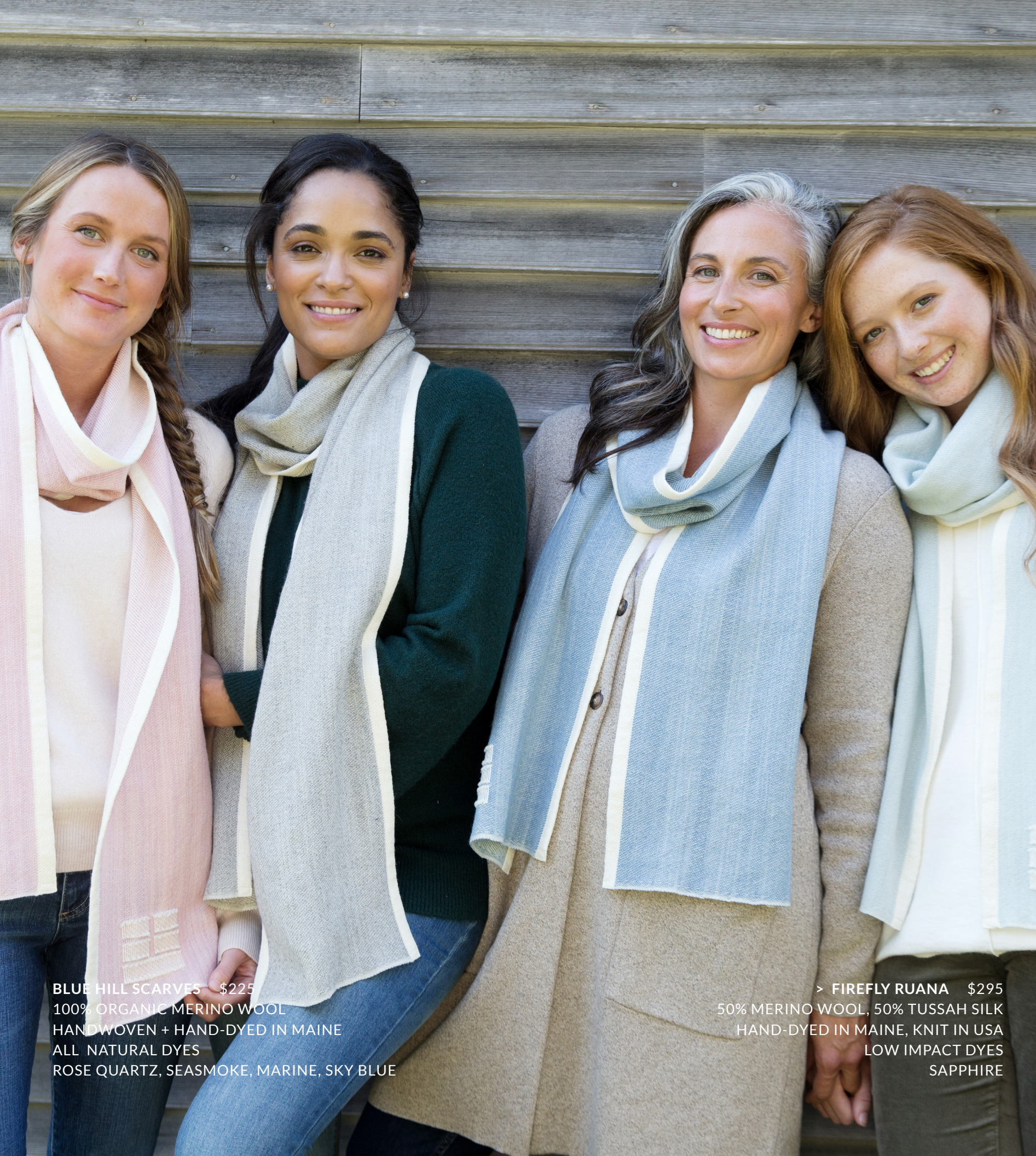
BLUE HILL SCARVES $225 100% ORGANIC MERINO WOOL HANDWOVEN + HAND-DYED IN MAINE ALL NATURAL DYES ROSE QUARTZ, SEASMOKE, MARINE, SKY BLUE