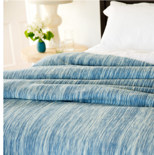
WATERCOLORS BLANKET $895 - $1095 100% MERINO WOOL HANDWOVEN + HAND-DYED IN MAINE ALL NATURAL DYES INDIGO + NATURAL