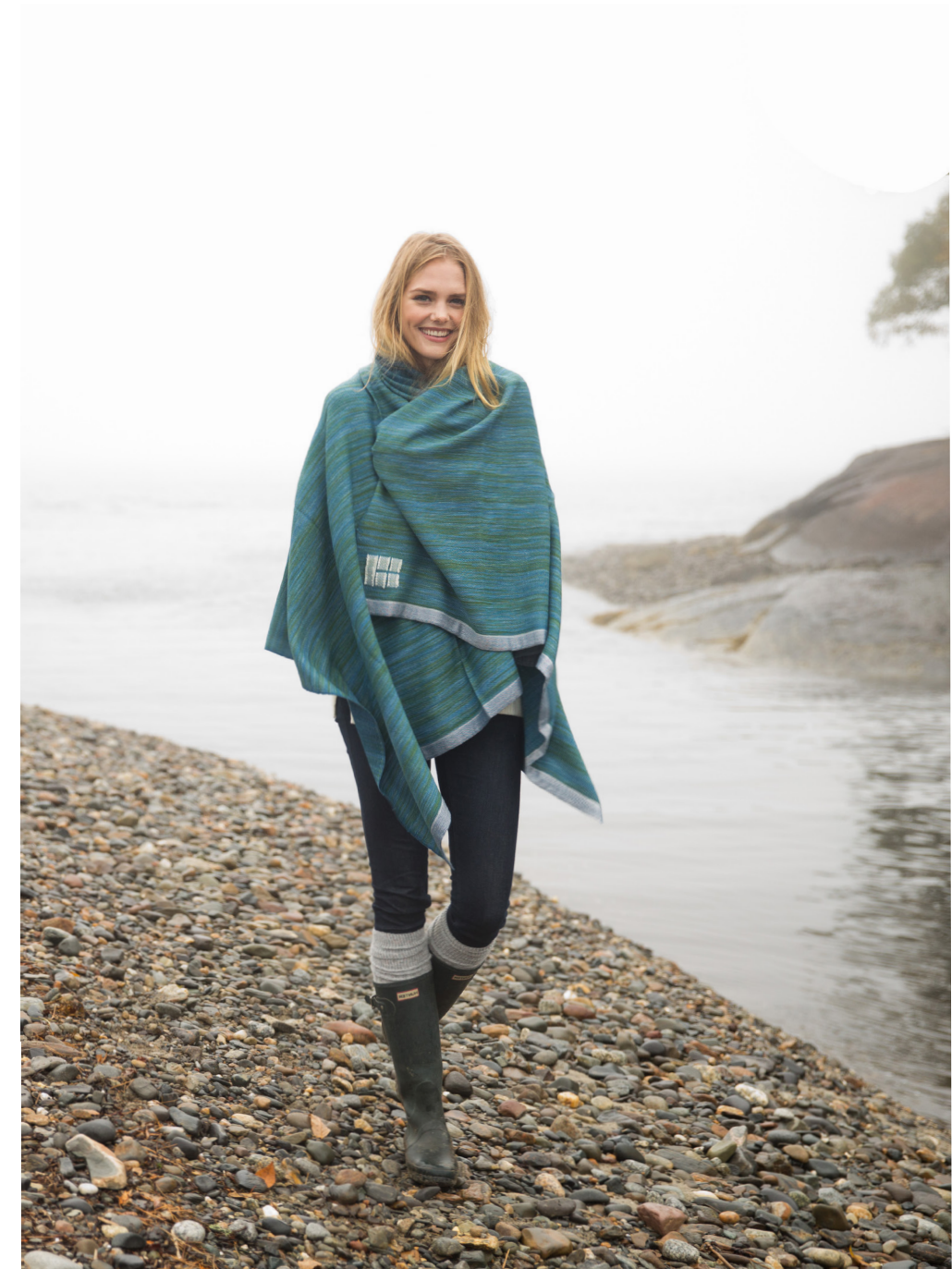
WATERCOLORS THROW $625 100% ORGANIC MERINO WOOL, 34% TUSSAH SILK HANDWOVEN + HAND-DYED IN MAINE ALL NATURAL DYES INDIGO + TEAL