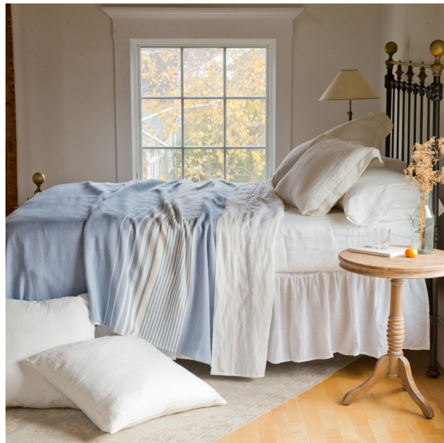
PENOBSCOT BLANKET $595 - $795 70% ORGANIC WOOL, 30% ORGANIC COTTON WOVEN + HAND-DYED IN MAINE LOW IMPACT DYES WEDGWOOD + WHITE